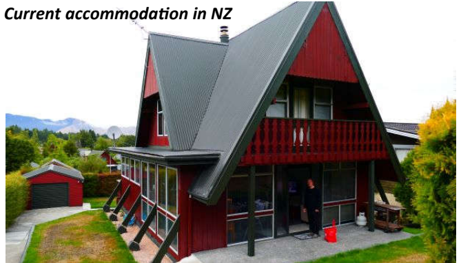
Current accommodation in NZ

We are so grateful that we are so well cared for and have such a restful beautiful place ( above ) to be in our “bubble”. What a privilege to be part of the MAF ‘family’, the Grace ‘family’ and our own families.